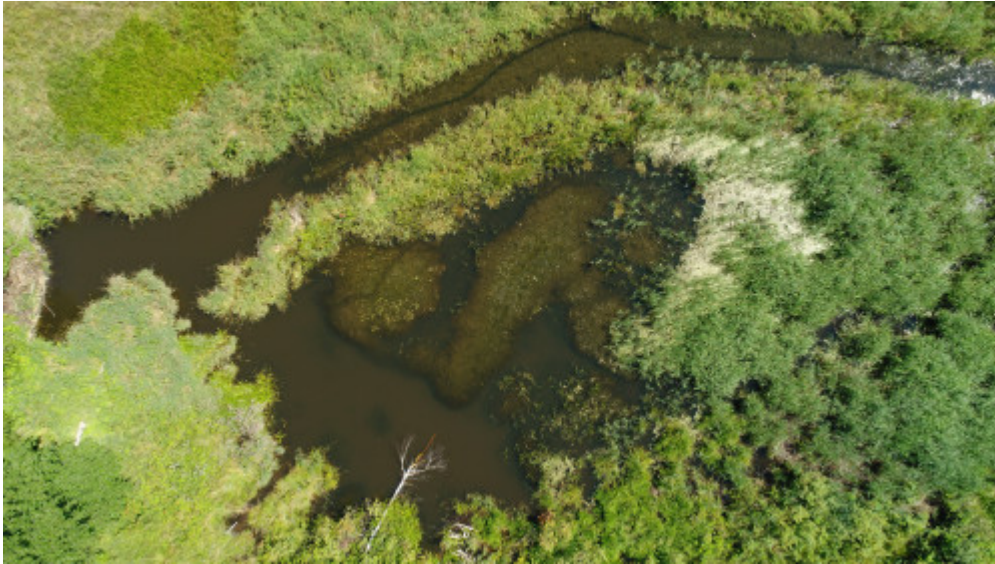
The landscape of the Włoszczowa region is absolutely beautiful