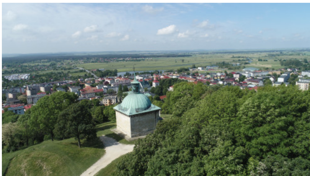
The Chapel of Saint Anne in Pińczów