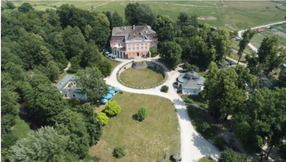
The splendid palace in Kurozwęki

Visiting Szydłów we can feel the medieval spirit of the age of chivalry. The town, called the “Polish Carcassone”, amazes visitors with its fortified walls and a piece of a fosse that is still visible.