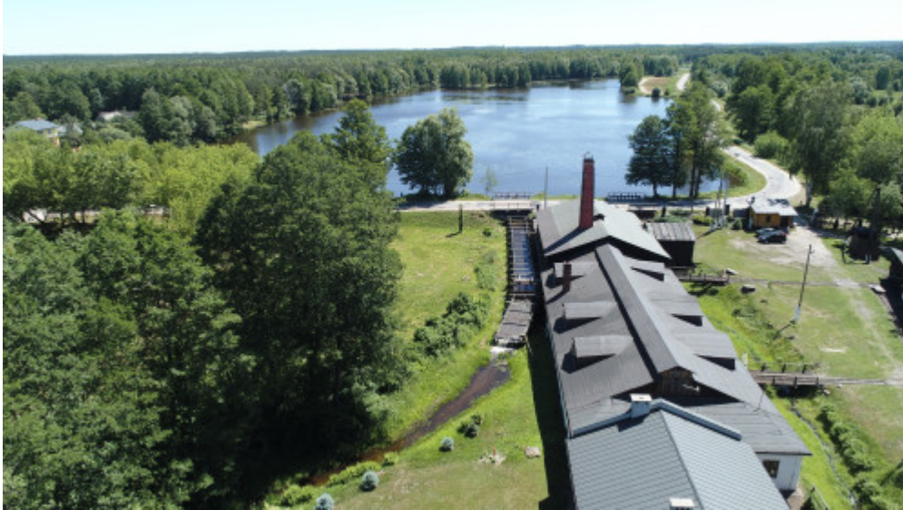
The ancient metallurgical plant in Maleniec

When travelling through the Świętokrzyskie region, it is worth stopping to rest in the Końskie area. We can admire the forest landscape along the Czarna River and its creeks. There are interesting cycle routes and reservoirs such as in Sielpia. Exceptional rock formations are worth seeing, especially in the Piekło Reserve near Niekłań. These Triassic and Jurassic rocks took the form of mushrooms, pulpits and chimneys. What is interesting, near to the settlement called Piekło (Hell), there is also Niebo (Heaven).