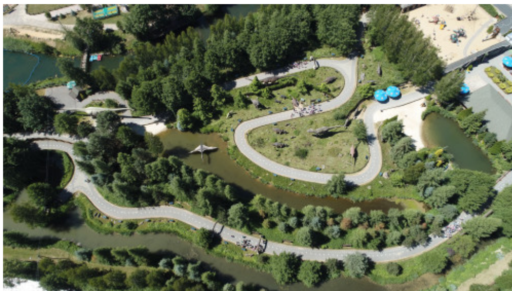
The Bałtów Jurassic Park

The journey through the Świętokrzyskie region continues following the valley of the Kamienna river. We reach the Neolithic flint mines in Krzemionki. It is a unique place, in which striped flint was exploited and processed 5 thousand years B. C. The blades of axes and chisels were made of flint at that time. These days, there is a preserve there, including mine corridors, shafts, mine tips, and a Neolithic settlement that is a reconstruction of that of the Stone Age and the early Bronze Age. The prehistoric world is also available for tourists in the Bałtów Jurassic Park. According to the legends told by the local residents, the devil impressed his footprint on a rock in the river valley. It led scientists to discover the tracks of three species of dinosaurs. Nowadays tourists can admire the reconstructed forms of primeval animals in their natural sizes. In Bałtów, a world of extinct creatures coexists with the present fauna. Many species of animals from far away continents live in the Bałtów preserve called Zwierzyniec. There are mouflons, llamas, camels, boar, exotic sheep and goats, antelopes, ostriches etc. Young and elderly guests, who yearn for thrills, can visit the Witch Village, the Land of Horses, the amusement park, and - in winter - the Santa Claus Village. Skiers can enjoy the Bałtów ski slope called the "Bałtów Switzerland" during the season.