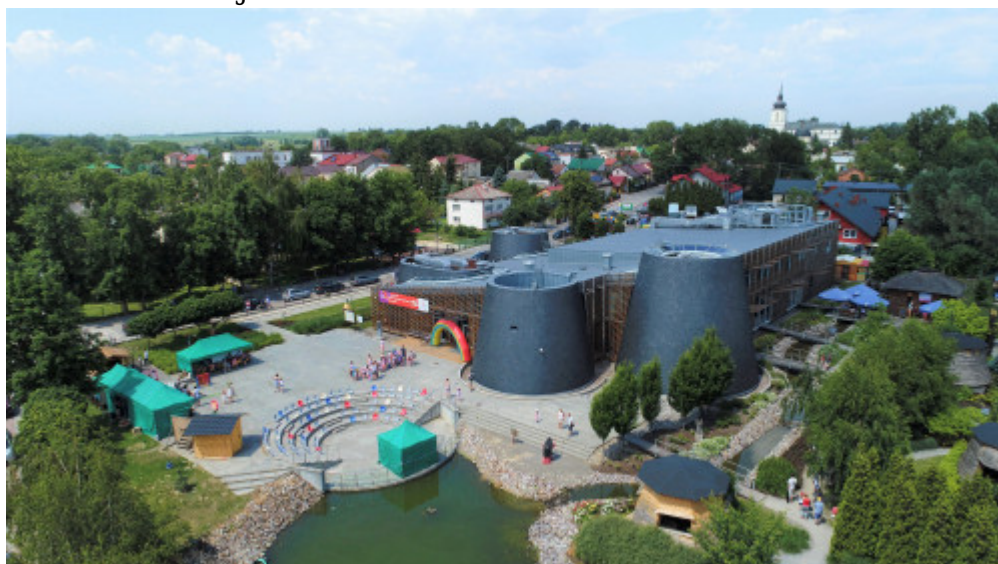
The European Tale Centre in Pacanów

It is worth visiting Busko-Zdrój and Solec-Zdrój to boost your health, physical condition and wellbeing. Patients suffering from rheumatism, orthopaedic, cardiological, neurological, and