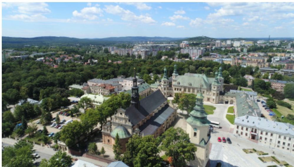
The Cathedral Hill in Kielce

Kielce is the capital of the Świętokrzyskie voivodship. It is situated at the heart of the region. There are five geological reserves in the city so it is a paradise for lovers of geology. They can discover some interesting facts of the earth's history, natural and landscape values.