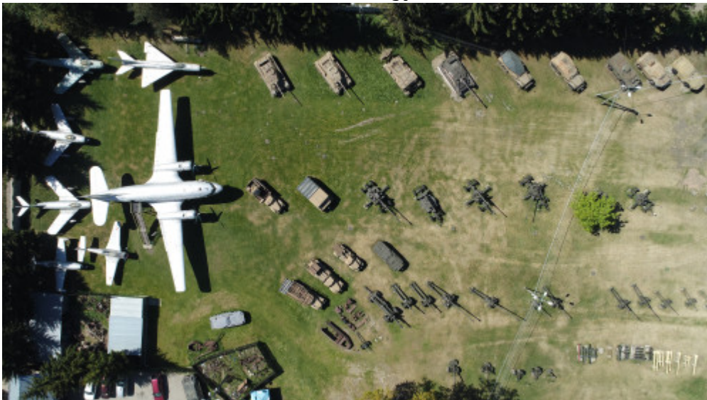
The Museum of the White Eagle in Skarżysko-Kamienna

Wąchock is associated with the Cistercian tradition. The monks were brought there at the beginning of 12th century. They contributed to the development of agriculture, established stone workshops, looms, quarries and metallurgical furnaces. However, the history of this