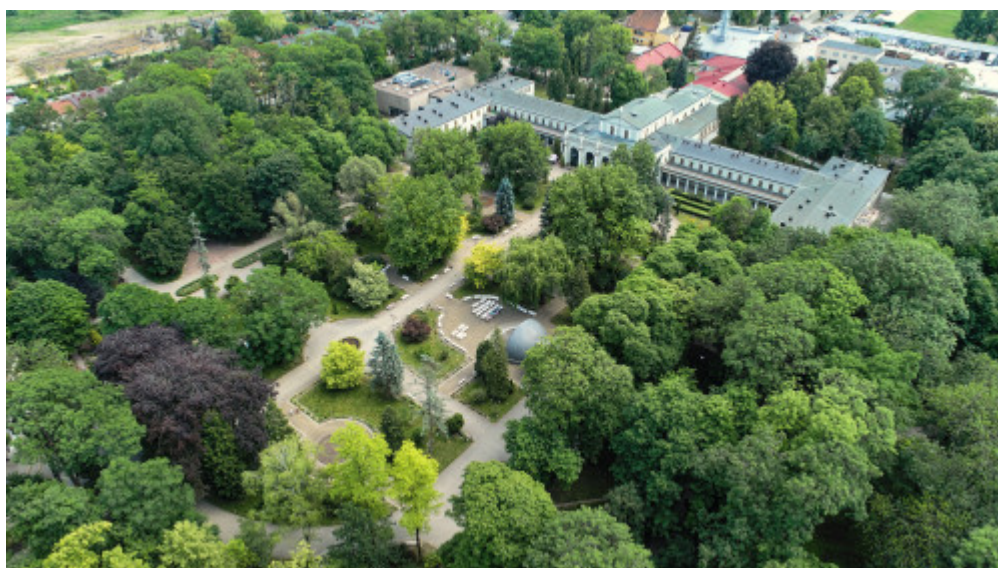
The Busko-Zdrój Health Resorts