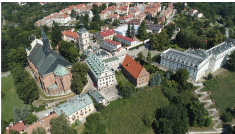
Sandomierz invites lovers of history and monuments