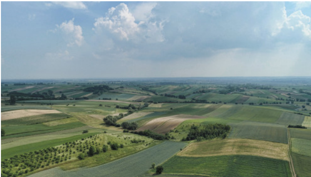
The picturesque view of the Kazimierza Wielka region

The Kazimierza Wielka area is a typical farming region due to the fertile loess soil. Cereal growing, vegetable cultivation and forage crop cultivation are the most common kinds of culture here. There are also ecological farms in this area.