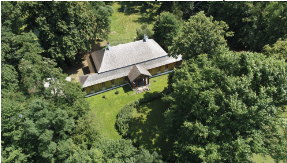
The famous manor house in Ludynia became a favourite setting for filmmakers

The Włoszczowa region is a rural and industrial area but there is also a large spread of forest so the place has a high ecological value. There are oak-hornbeam forests, mixed woodland and in the river valleys - riparian and alder forests. Thick willow bushes grow along the meandering rivers. In places it changes into watery meadows, marshes and peatbogs.