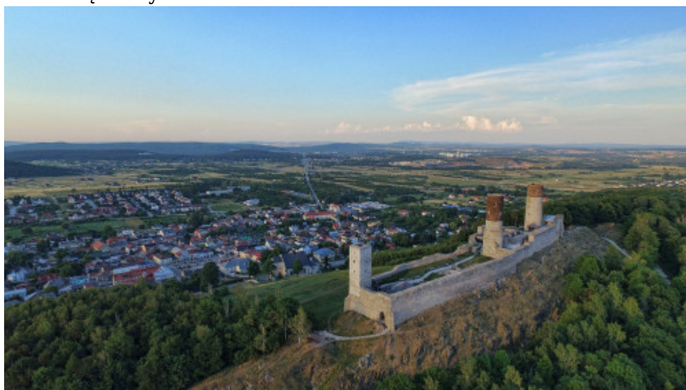
The Royal Castle in Chęciny

The Świętokrzyskie Mountains, located at the heart of the region, are the oldest mountains in Poland. A million years ago the sea was there. The past left its traces in rocks in the form of coral, trilobites, and fish fossils. In the distant past the Świętokrzyskie Mountains were alternately flooded with sea water and uplifted. Currently, the Świętokrzyskie Mountains include steep slopes covered with fir forests, beautiful valleys, and representative boulder fields which remain after past glaciations. The most important part of the mountain range, called Łysogóry, includes Łysica and Łysiec. There is a Benedictine monastery at the top.