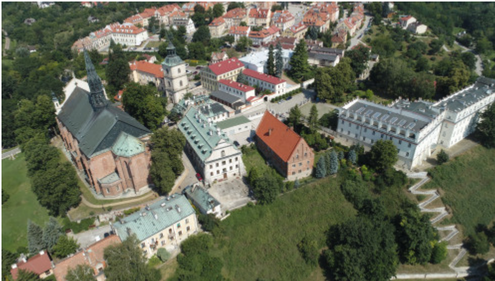
Sandomierz invites lovers of history and monuments