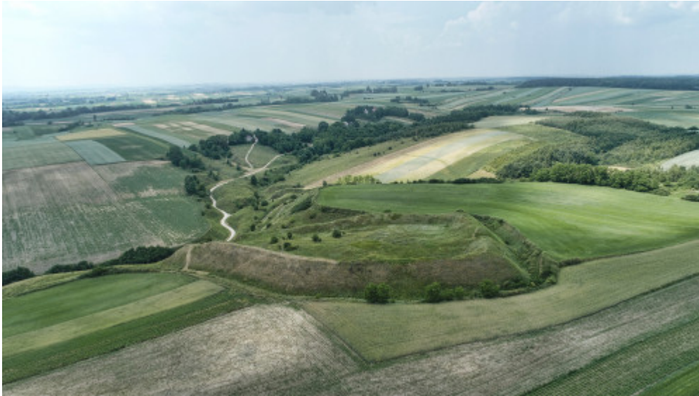
Reminiscences of the Vistulan tribe fort in Stradów