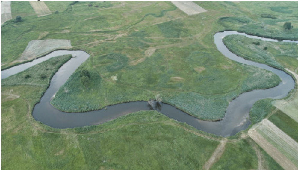
The Nida River

The beauty of Ponidzie fascinates both the residents and tourists. The Nida River, with its meanders and vicinal meadows, encourages the admiration of the beauty of nature while cycling, hiking or canoeing. We can hear the unforgettable sound of cicadas here. There are nature reserves with remarkable swamp and steppe plants. One of the most interesting plant species is the dittany.