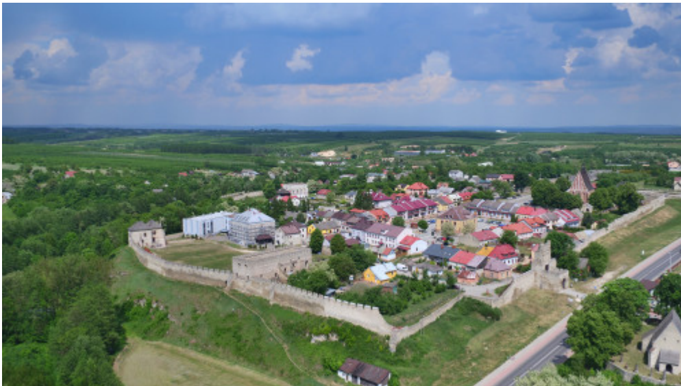
Szydłów, the town called the “Polish Carcassone”