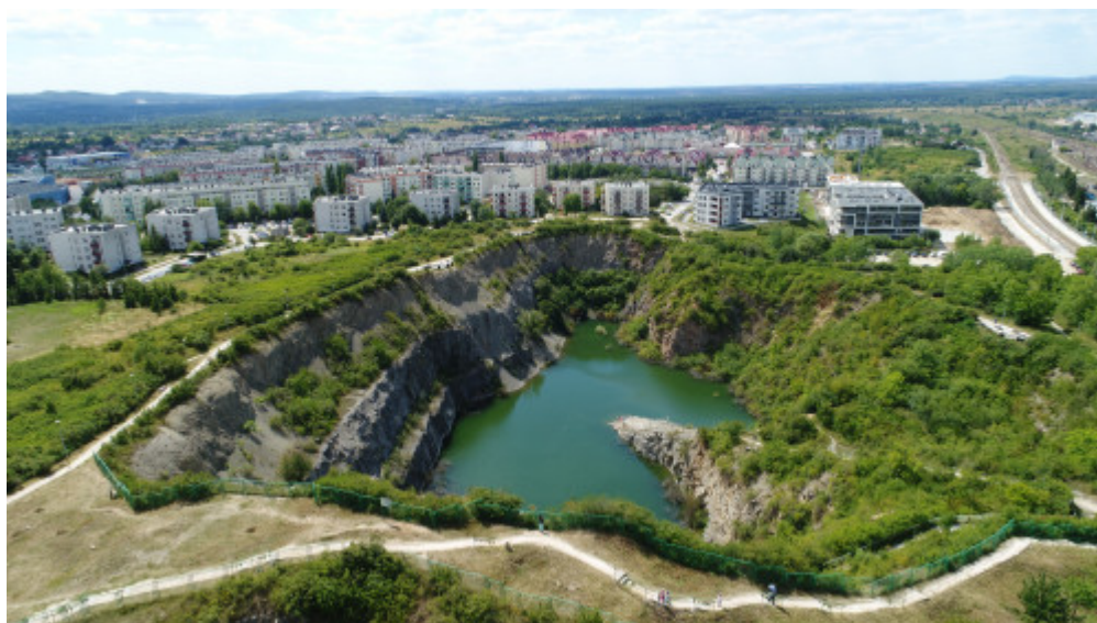
The geological preserve in Kielce - Ślichowice