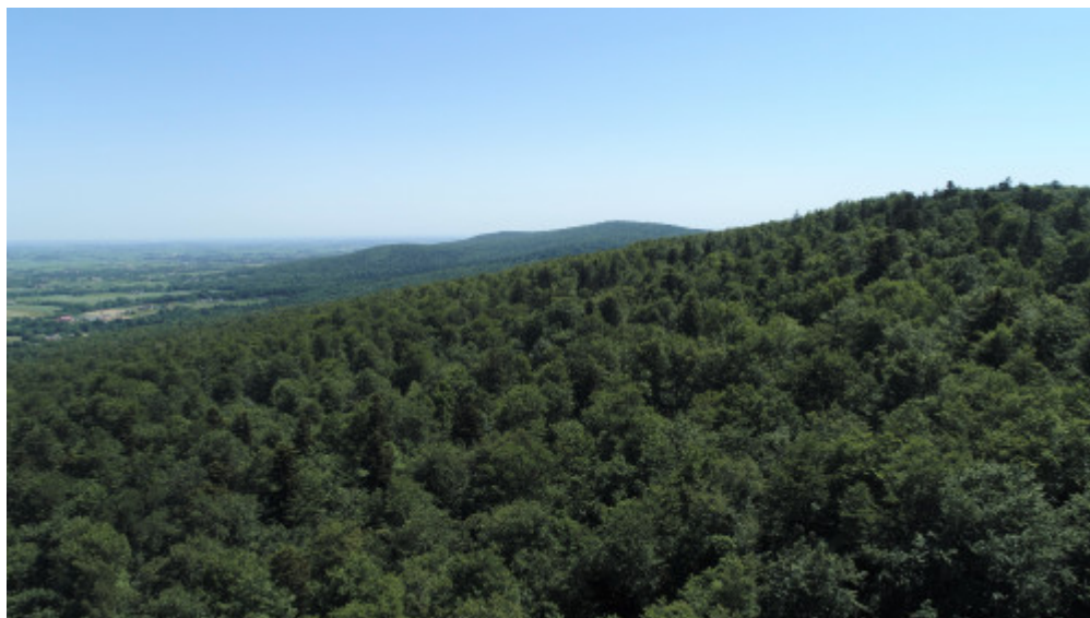
The Świętokrzyskie Mountains