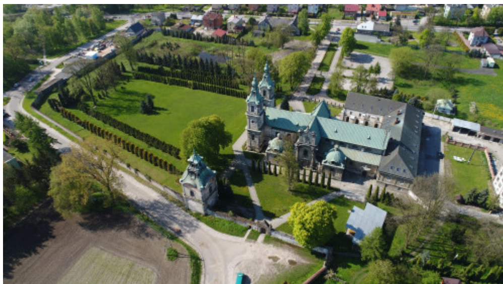
The Cistercian monastery in Jędrzejów

The oldest Cistercian monastery in Poland is located in Jędrzejów. It is one of the most important and most willingly visited relics. The monastic brothers, who came there in the 13th century, had a great impact on the growth of the locality. They supported the establishment of smelters, glasshouses, the development of metallurgy, agriculture and animal farming. The hospital and hospice were also instituted by the Cistercians. The medieval author of the first Polish chronicle, Wincenty Kadłubek, lived and acted there, so there is a chapel dedicated to him.