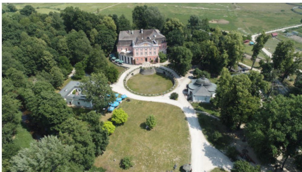
The splendid palace in Kurozwęki

Visiting Szydłów we can feel the medieval spirit of the age of chivalry. The town, called the “Polish Carcassone”, amazes visitors with its fortified walls and a piece of a fosse that is still visible.