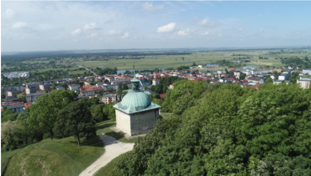
The Chapel of Saint Anne in Pińczów