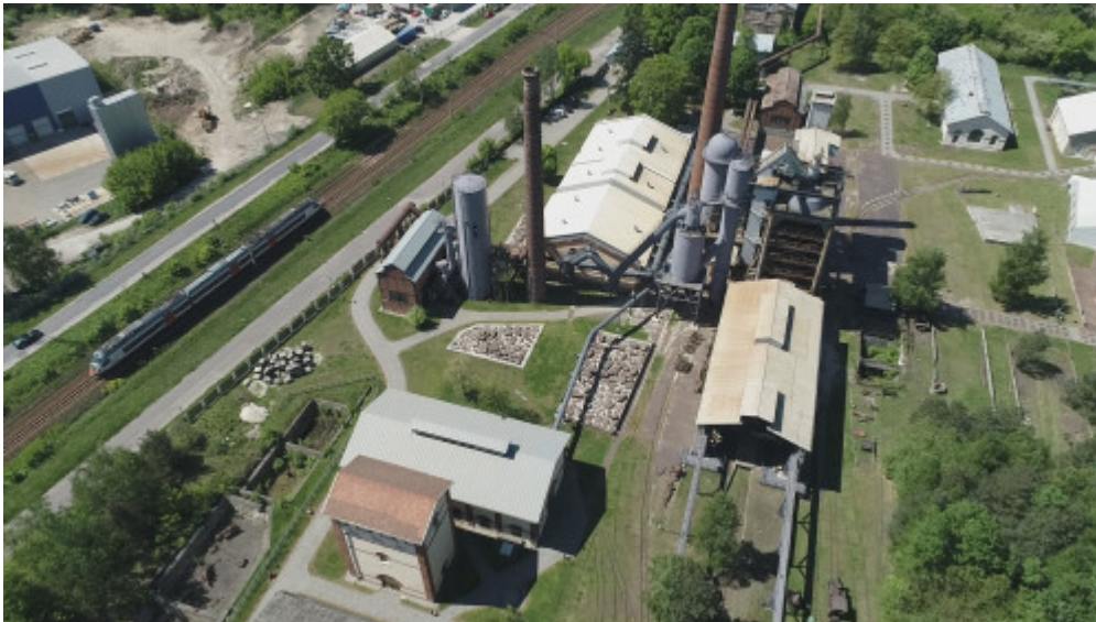
The Museum of Nature and Technology in Starachowice

(The Starachowice and Skarżysko Kamienna regions)