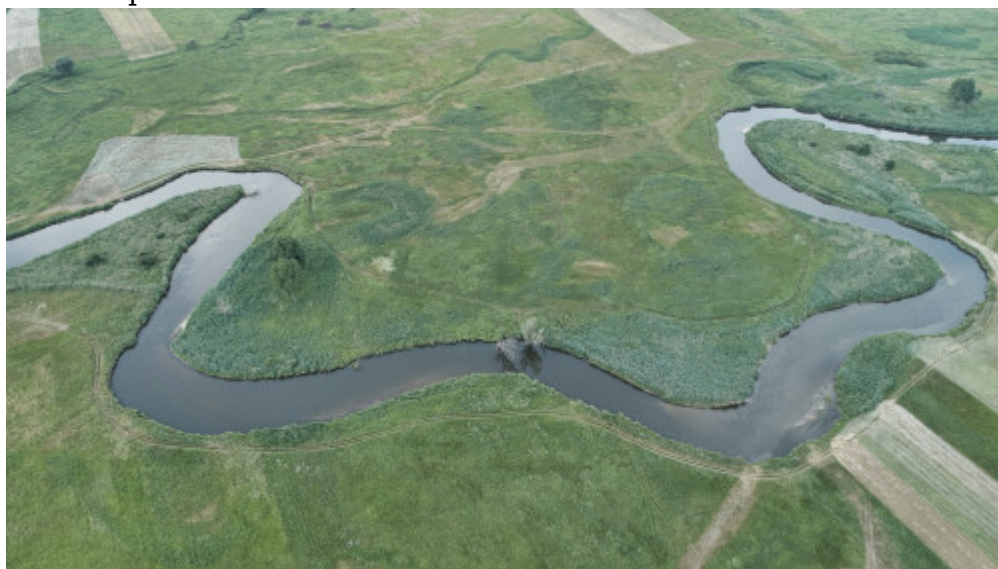
The Nida River

The beauty of Ponidzie fascinates both the residents and tourists. The Nida River, with its meanders and vicinal meadows, encourages the admiration of the beauty of nature while cycling, hiking or canoeing. We can hear the unforgettable sound of cicadas here. There are nature reserves with remarkable swamp and steppe plants. One of the most interesting plant species is the dittany.