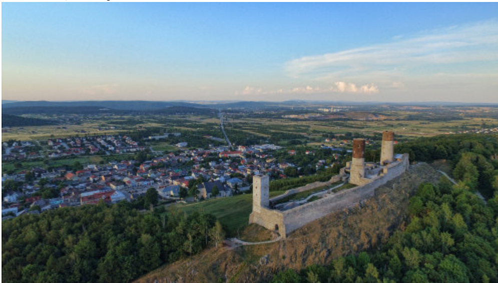
The Royal Castle in Chęciny

The Świętokrzyskie Mountains, located at the heart of the region, are the oldest mountains in Poland. A million years ago the sea was there. The past left its traces in rocks in the form of coral, trilobites, and fish fossils. In the distant past the Świętokrzyskie Mountains were alternately flooded with sea water and uplifted. Currently, the Świętokrzyskie Mountains include steep slopes covered with fir forests, beautiful valleys, and representative boulder fields which remain after past glaciations. The most important part of the mountain range, called Łysogóry, includes Łysica and Łysiec. There is a Benedictine monastery at the top.